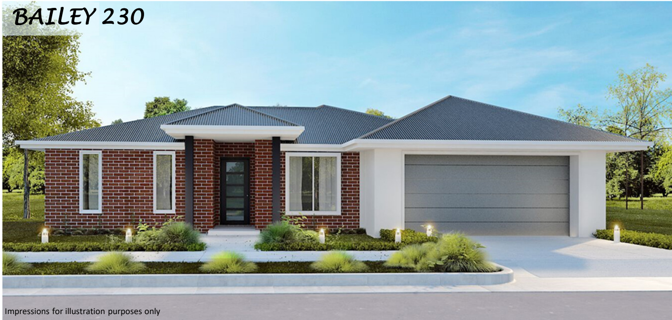
Impressions for illustration purposes only