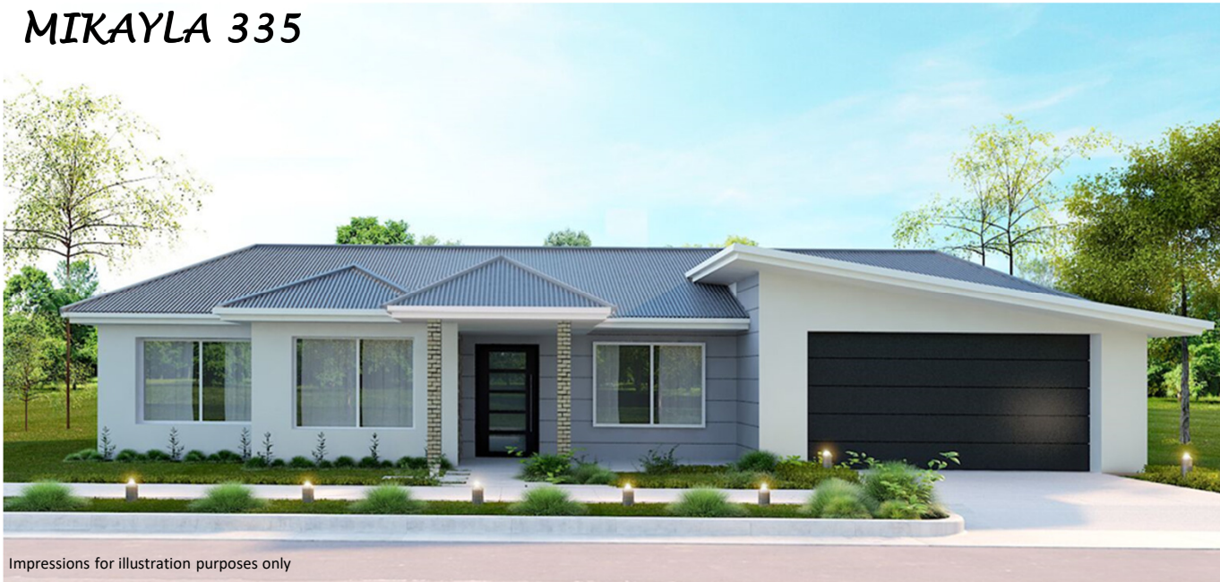
Impressions for illustration purposes only